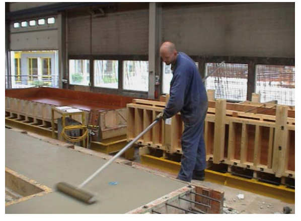
Figure 7: Finishing the surface.

For finishing SCC after casting, practical methods have been developed. After waiting a period of time and sprinkling drop of water on the concrete, the surface of the element can be treated and finished, as specified by the client, see Figure 7. That period of time is depending on the type of SCC, the ambient temperature