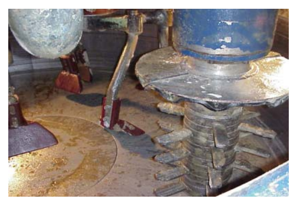
Figure 3: Wirbler and scraper installed

The mixing cycle will be slightly longer than for normal concrete. The installation of a wirbler in the mixing pan supplies more mixing energy and will increase the mixing quality and dura-