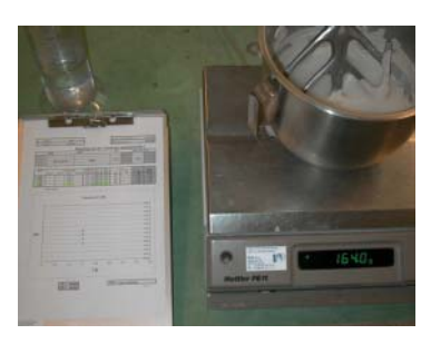
Figure 2a: Weighing powder and water accurately.

The mortar may contain a relative high volume of sand, compared with the Japanese mortar in SCC. It was learned that a ratio Vsand / Vmortar = 0,45, a slump flow of 300 to 350 mm and a funnel time between 5 and 12 seconds is a good base for SCC in the industry.