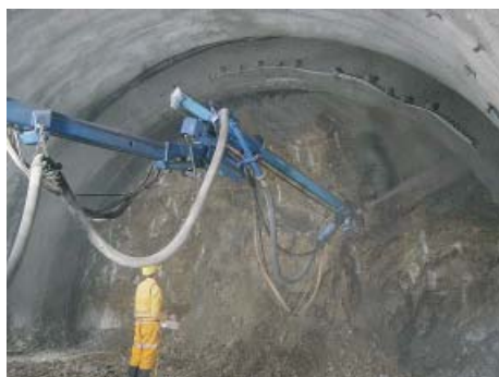
Picture 7 – Tunnel Sitina – shotcreting of primary lining